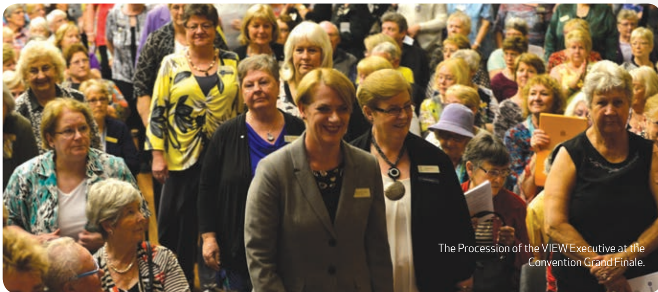
The Procession of the VIEW Executive at the Convention Grand Finale.