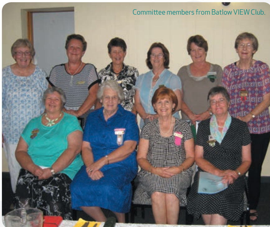
Committee members from Batlow VIEW Club.

Chocolate is a common theme for Corowa VIEW Club's members. The club recently had a social outing to another local chocolate venue where they enjoyed artisan handmade chocolates and other local produce.