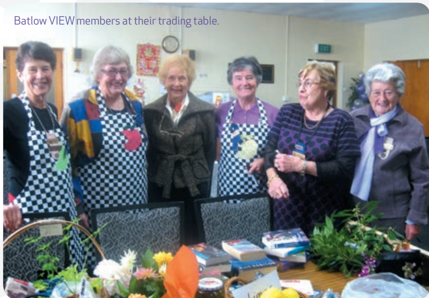
Batlow VIEW members at their trading table.

Batlow VIEW Club's major fundraiser is a monthly trading table where members sell surplus supplies from their vegetable gardens, home-made jams, biscuits, eggs and other items. The money raised goes towards supporting two Learning for Life students. An interesting guest speaker at each luncheon offers all members a chance to up date their knowledge and understanding of a variety of topics that provoke questions and discussion.