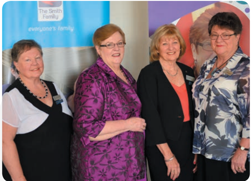
National Executive 2014-15.