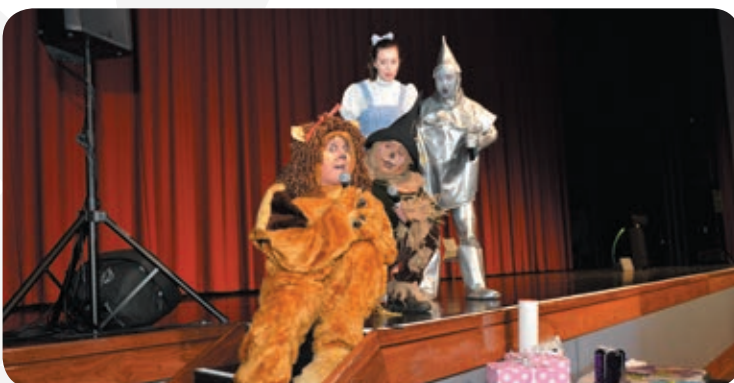
Gala Dinner entertainers.