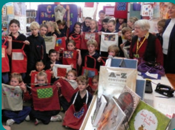
Lumen Christi Catholic College students receiving their much-needed library bags from Merimbula Evening VIEW Club members.

Cootamundra Day VIEW Club (NSW) has experienced a decline in members, but that hasn't stopped the vibrant club from contributing to The Smith Family in many different ways. In addition to sponsoring three Learning for Life students, members recently spent an afternoon sewing library bags and reading mats for disadvantaged students from Wagga Wagga.