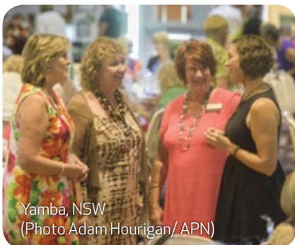
Yamba, NSW