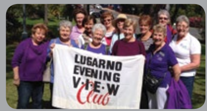
Lugarno Evening VIEW Club members.

in purple and proudly carrying their VIEW banner, the walkers were joined by other (non-walking) members for coffee and lunch before and after the casual walk.