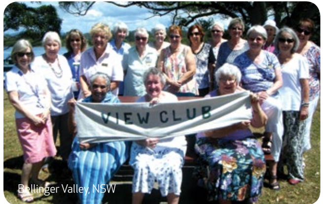
Bellingen Valley, NSW