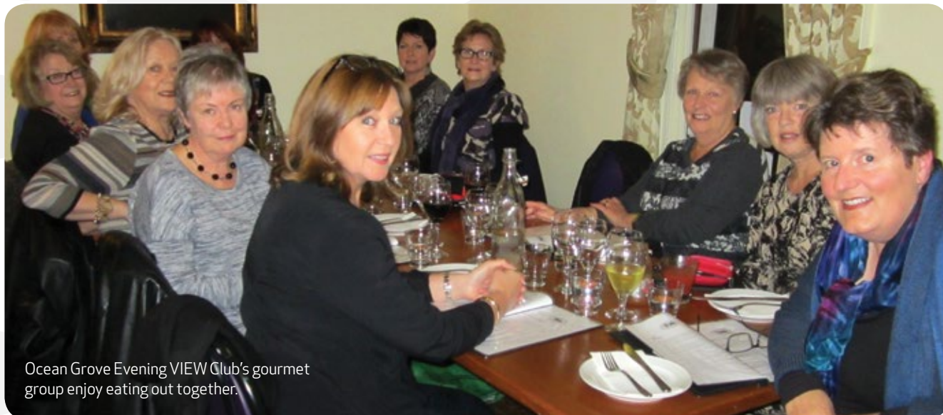
Ocean Grove Evening VIEW Club's gourmet group enjoy eating out together.

In 2016, the club is looking forward to welcoming new members and introducing new activities and fundraising opportunities to help support The Smith Family and Learning for Life students.