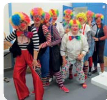
Queanbeyan's clown group.