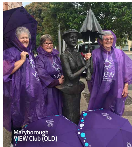
Maryborough VIEW Club (QLD)