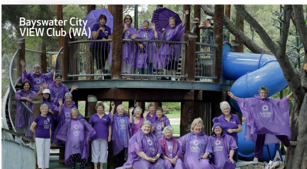
Bayswater City VIEW Club (WA)