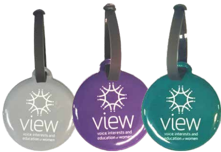
Luggage tags $2.00 each