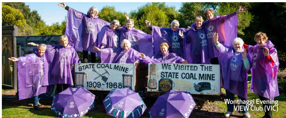
Wonthaggi Evening VIEW Club (VIC)

Photos of our National Convention Online Raffle winners and Purple Poncho competition entries.