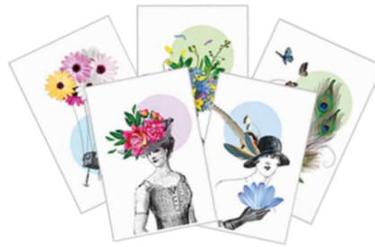
Pack of 10 notecards $8.00