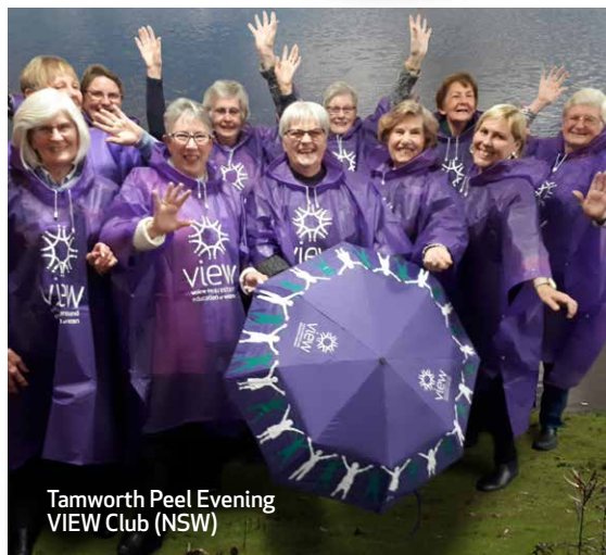
Tamworth Peel Evening VIEW Club (NSW)