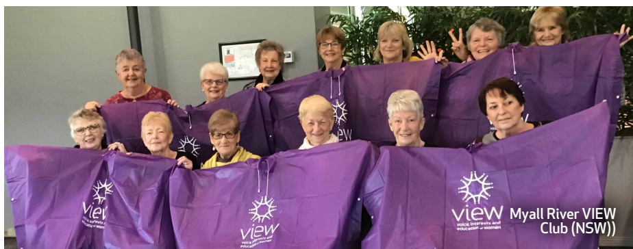
view Myall River VIEW Club (NSW)