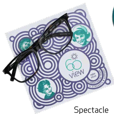
Spectacle cleaner $4.00