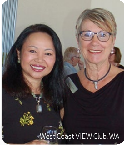
West Coast VIEW Club, WA