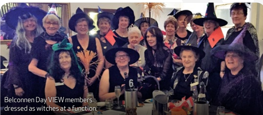
Belconnen Day VIEW members dressed as witches at a function.

Participating in community activities is proving to be a good method of fundraising for members from the Batlow VIEW Club (NSW). In October last year, the club joined in the National Garage Sale Trail initiative by setting up their own stall selling books, bikes and household items. Proceeds from the Garage Sale were donated to The Smith Family. In the same month, members also took part in the Open Garden weekend at Tumbarumba, welcoming visitors to the gorgeous garden of Ann Miles at Fallowfields while collecting donations for The Smith Family and promoting the work of VIEW Clubs.