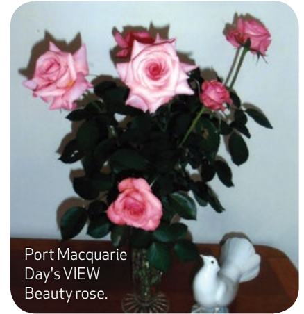
Port Macquarie Day's VIEW Beauty rose.