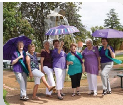
Members from Leeton VIEW Club (NSW).

All entrants will be acknowledged on the VIEW Facebook page, celebrated at VIEW National Convention 2017 and posted on the VIEW website. Enter your photo now!