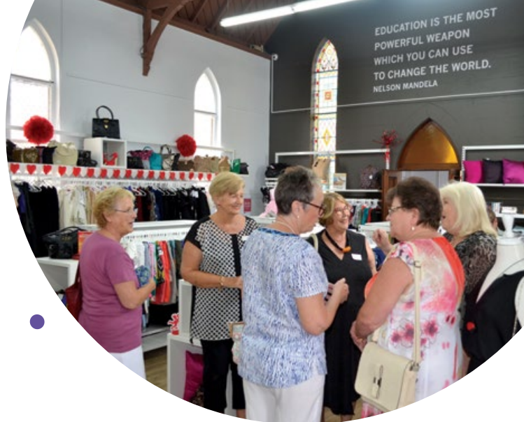
VIEW members enjoyed opening day sales at The Smith Family's new Kempsey retail store.