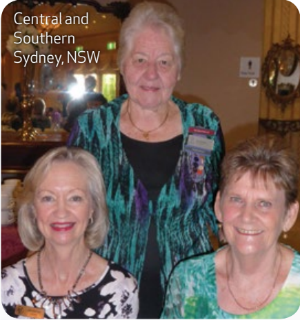
Central and Southern Sydney, NSW

Photos from events hosted by VIEW Clubs around Australia