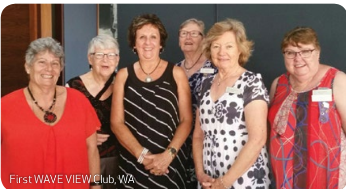
First WAVE VIEW Club, WA