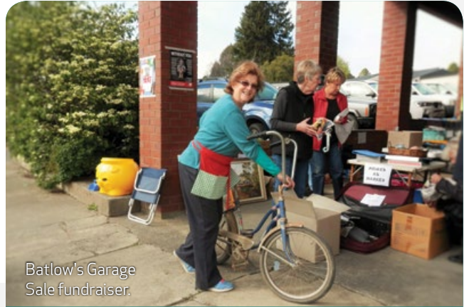
Batlow's Garage Sale fundraiser.

All clubs are encouraged to apply for community or local council grants to assist with the purchase of club equipment (see Club Handbook).