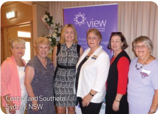
Central and Southern Sydney, NSW