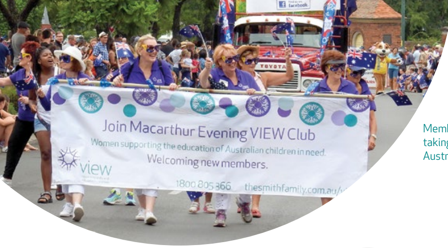
Members of Macarthur Evening taking part in the Camden 2017 Australia Day parade.