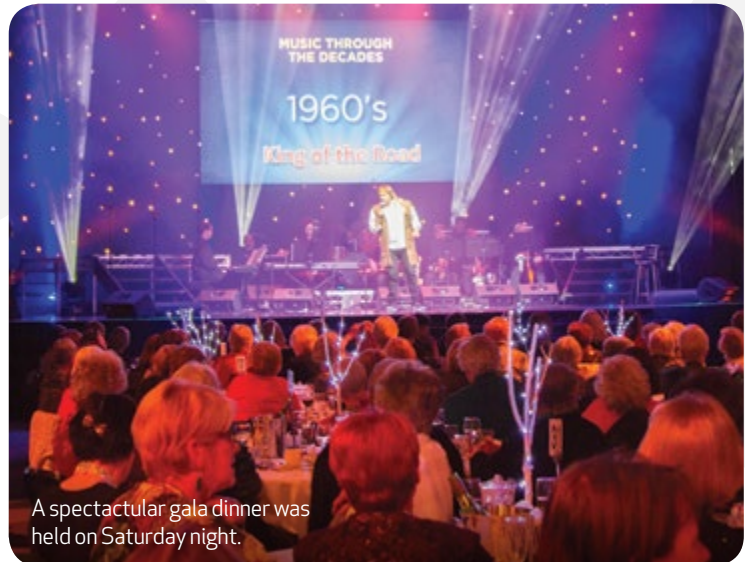
A spectacular gala dinner was held on Saturday night.

See page 14 for photos of all the colour and fun at the social events.