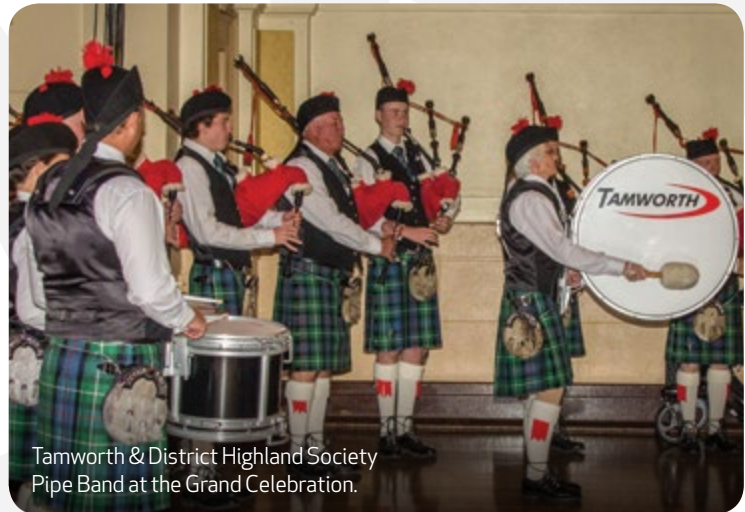
Tamworth & District Highland Society Pipe Band at the Grand Celebration.