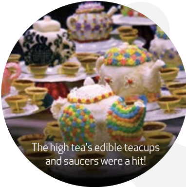
The high tea's edible teacups and saucers were a hit!