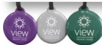
VIEW Travel Pack