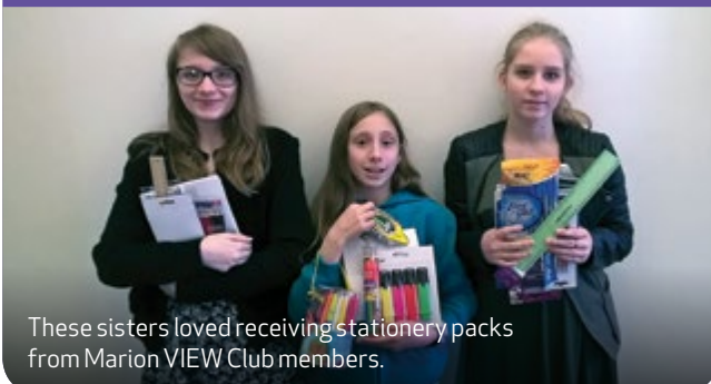
These sisters loved receiving stationery packs from Marion VIEW Club members.