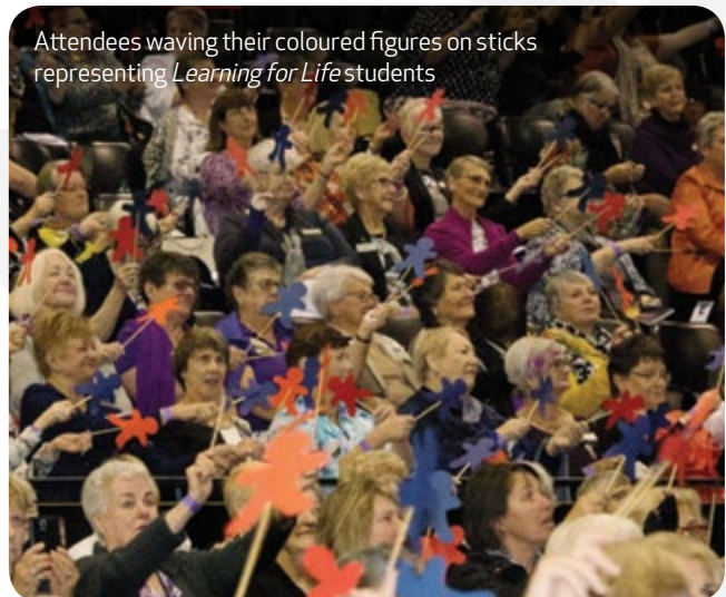
Attendees waving their coloured figures on sticks representing Learning for Life students