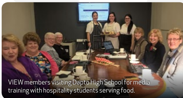
VIEW members visiting Dapto High School for media training with hospitality students serving food.

Food served at the training session was prepared by hospitality students at the school and VIEW members were asked to assess their performance. The training ended with a tour of the school and an invitation for members to return for future events.